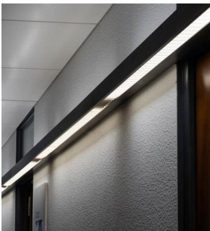
Wall lighting with prefabricated harness

Bonn “Langer Eugen” high-rise building for members of parliament future-proof and EU-compliant. By integrating SubstiTube LED tubes and LED downlights into the existing luminaire stock, not only the light quality and the maintenance effort are optimized. Through a CO 2 reduction of – depending on the area 49 to 61% – LEDVANCE also sets a strong example for sustainable lighting solutions in this prominent environment.