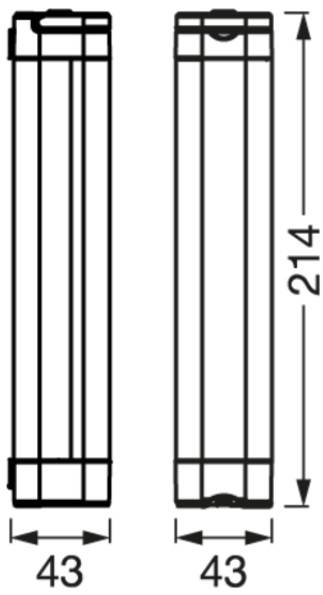
PGLINEAR LED TASK LIGHT 200MM IP54 WTMiPRCmnk